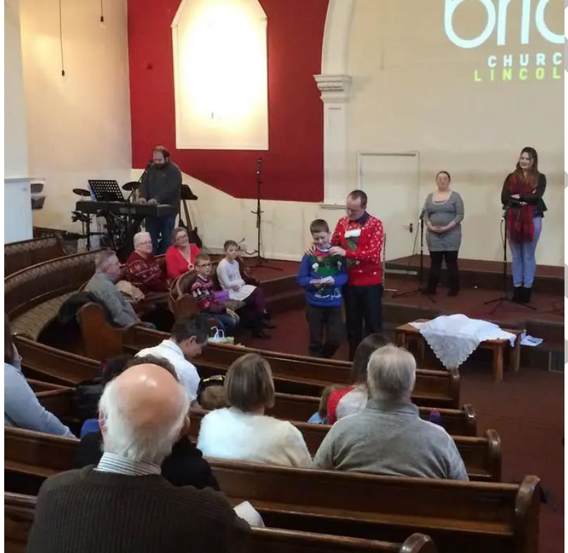
Figure 4 Bridge Church, Lincoln - From Bridge Web Site.

During the year the Vice-Chair invited SACRE to review its performance using the NASACRE Self-Assessment Tool. This noted the challenging and diverse work of SACRES and highlighted an opportunity for Lincolnshire SACRE to identify its strengths and weaknesses and draw up a plan showing areas for development. The following points were made by members in relation to the different sections of the Self-Assessment Tool: