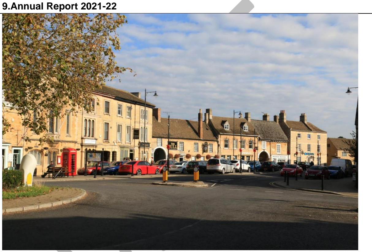
Figure 6 Market Deeping High Street

syllabus was rooted in building knowledge of the particular religions, whilst providing a balance of religious worldviews, and questioned whether there was a need to move towards looking at concepts of worldviews to transform learning, rather than focusing solely on teaching specific religious worldviews. A vote was taken and members unanimously voted to request a deferral of the review of the agreed syllabus, in line with guidance from NASACRE. This would provide time for more thought to be given to how the review should be approached. It was therefore recommended to the LA that the review of the agreed syllabus be deferred for a year. Following this decision, NASACRE were consulted on the matter and confirmed that it was satisfied with the deferral, given that the actual process of review had begun in 2023.