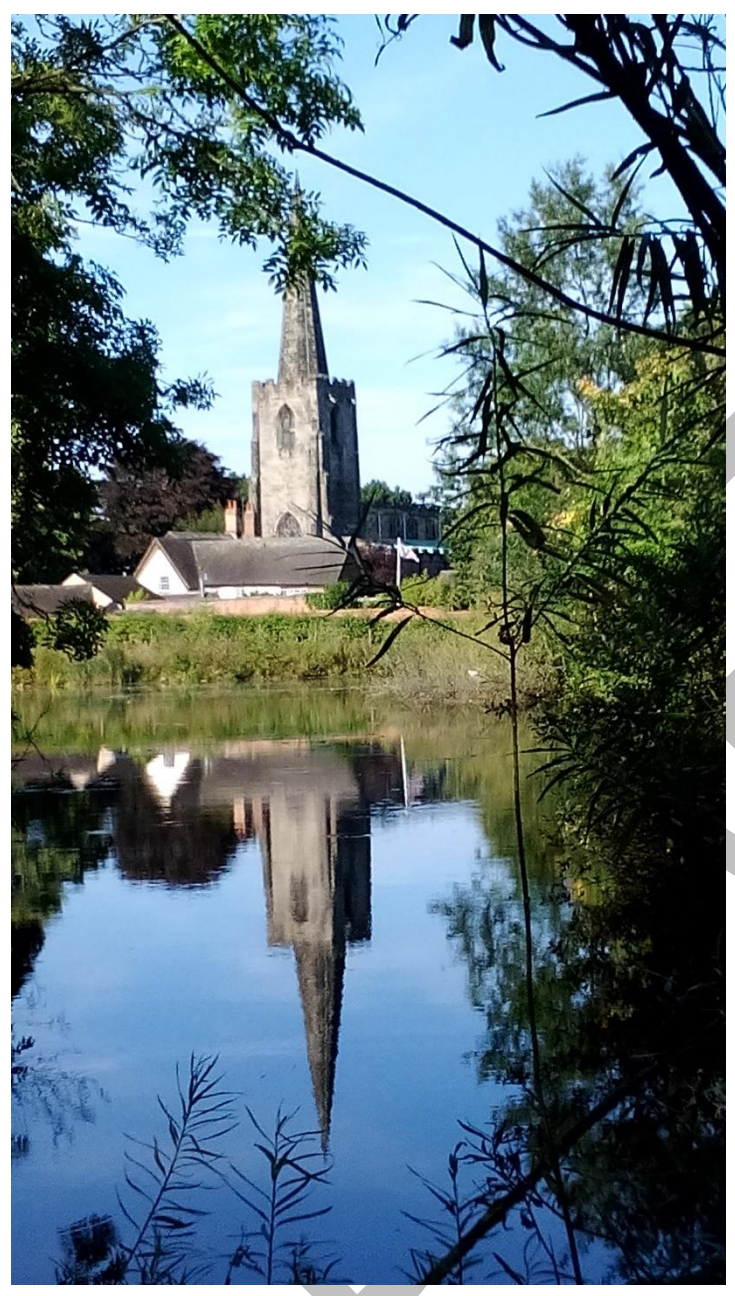
Figure 3 St Peters Church, Claypole

statutory requirements. Schools also needed to note the points raised in the Ofsted R.E Research Review (2021).